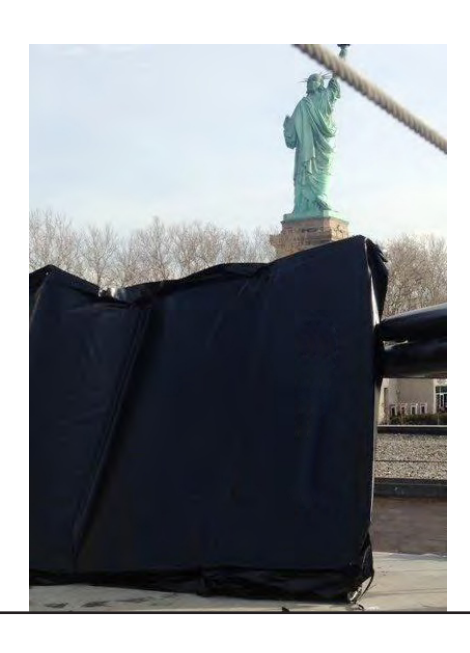
READY TO SHIP